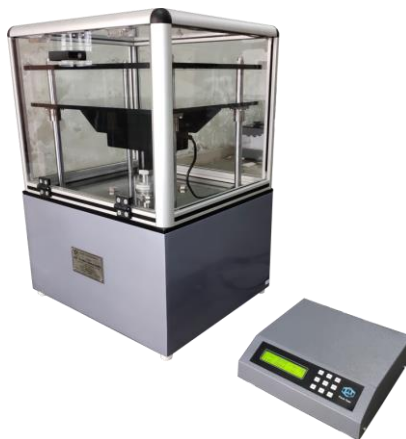
Pouch Compression – Large Size